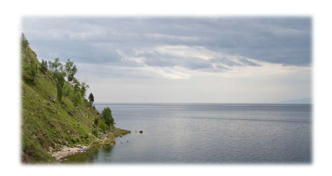
The 19 Congress of the Asian College of Psychosomatic Medicine